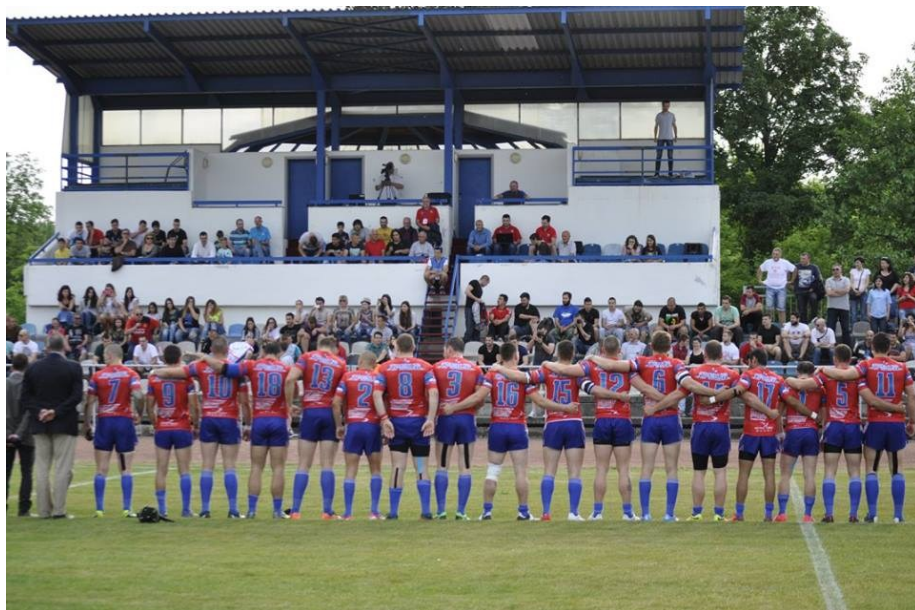
Home ground of Serbian Rugby League National Team - Stadium NC Makis in Belgrade